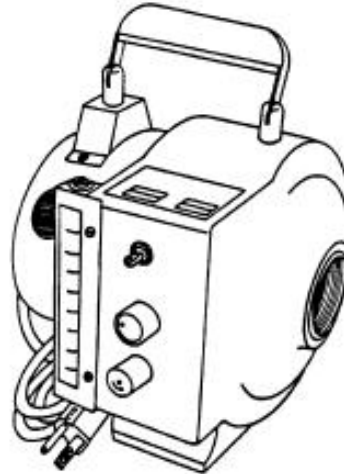
Figure 3 Low Volume Sampler