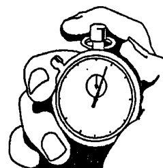
T i m e