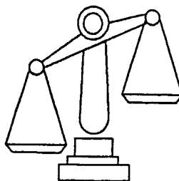
M a s s